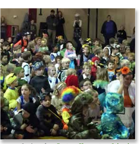
Students from Eastern Elementary School in Traverse City held a jog-a-thon in October to raise $1.250 for the Breast Care Assistance Fund.

The annual Remembrance Run in October presented by the women of the Traverse City Track Club raised nearly $3,300 for the Women's Cancer Fund, which helps pay for prosthetics, transportation, groceries, childcare, and utilities while women are going through treatment.